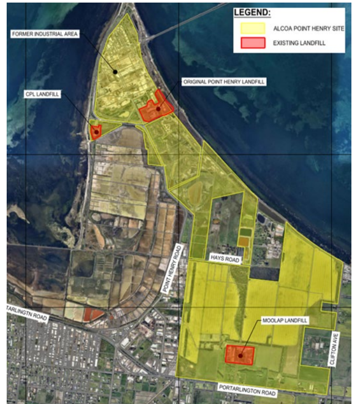
Above: Aerial photograph highlighting the three existing landfills at Point Henry.

The landfill consolidation project is underpinned by a Works Approval from EPA Victoria and a Planning Permit from CoGG. Both approvals are subject to stringent conditions. Read more about the project here .