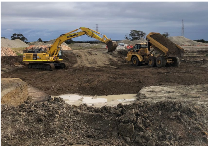
Above: Backfilling with successfully treated soils.

Remediated soils have been progressively backfilled to where the soils originated, and this will continue in coming months.