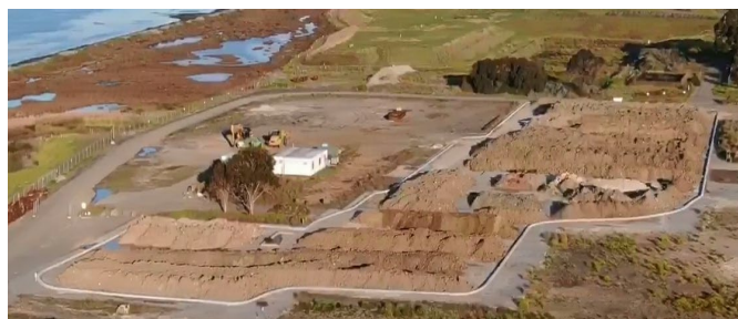
Above: Aerial view of soil stockpiled and ready for bioremediation treatment

The treatment process involves spreading, periodic turning and mulching of the soil, and once completed we plan to reuse the soil on site.