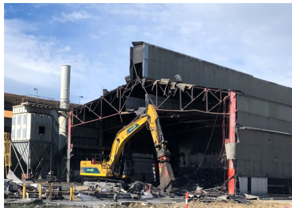
Above: Demolition activity on the former Bakes buildings.

Preparatory activities included the removal of equipment such as overhead cranes and other infrastructure, as well as cleaning. The demolition started in late August and is expected to be completed in 2021.